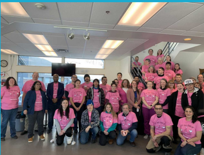
UNW Local 12, 2023

Wear pink on Wednesday, February 28th to participate!